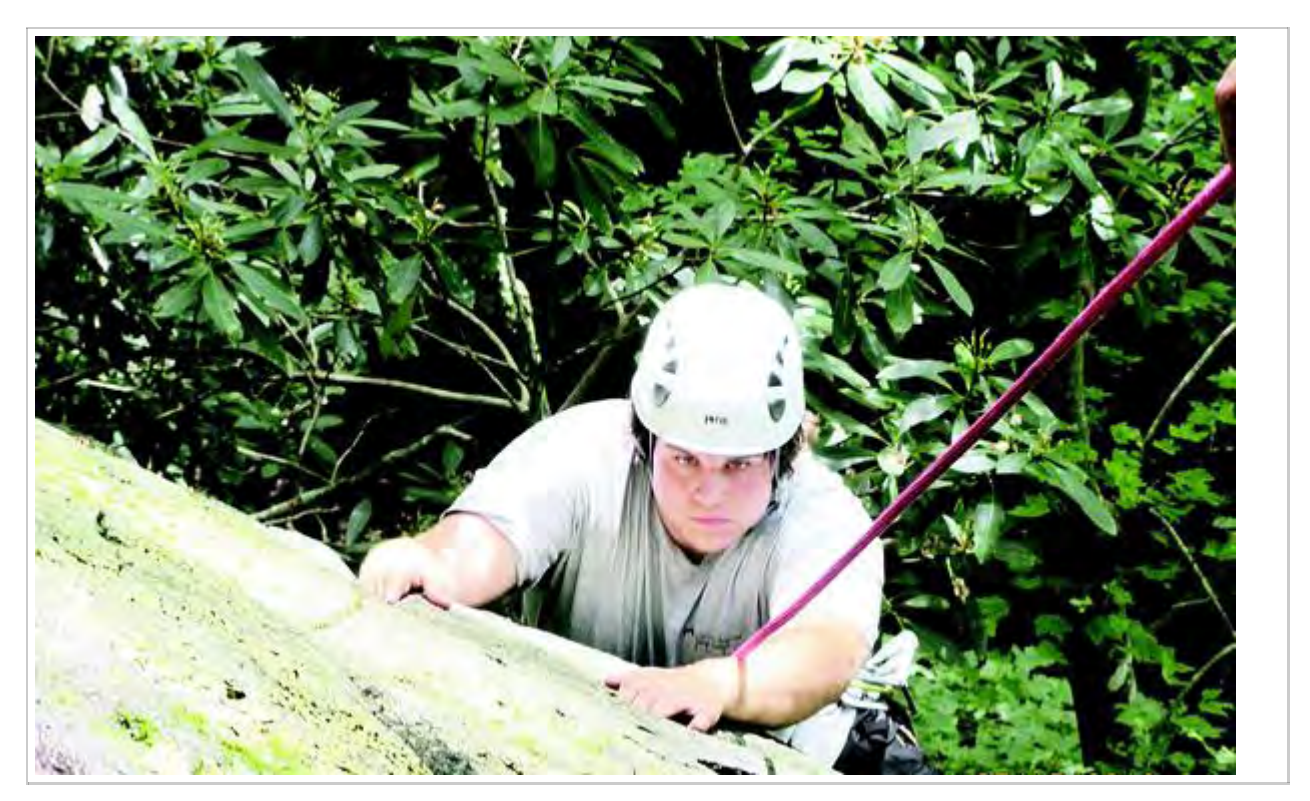
SPECIAL | HPE