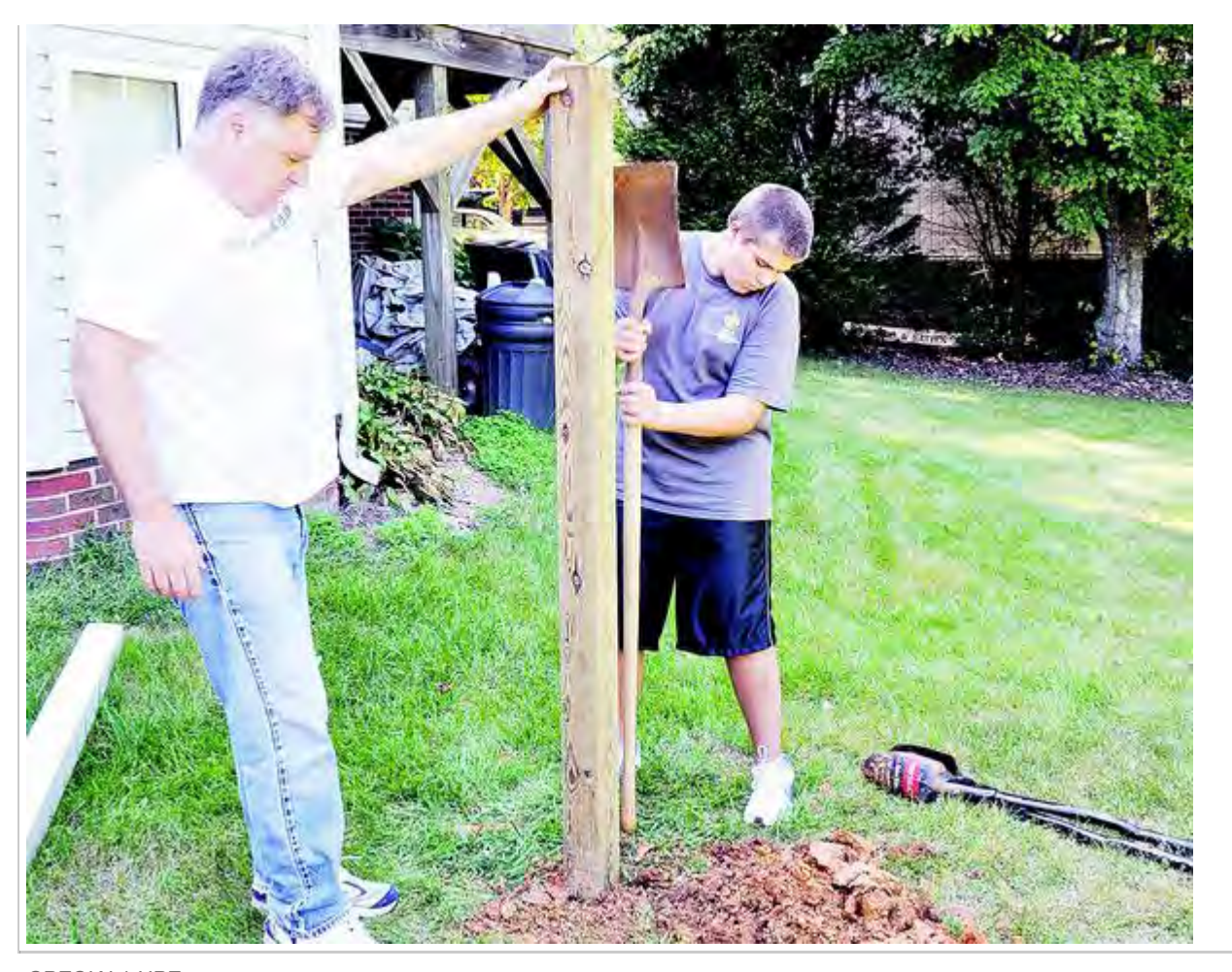
SPECIAL | HPE