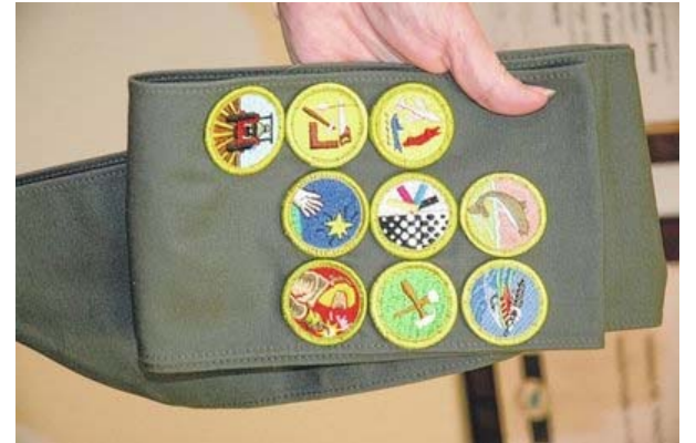
He earned so many badges, he had to start a second sash to hold them all.