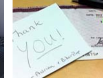
Forget Social Security. If You Own a Home, Do This! (It's Live Smarter Journal