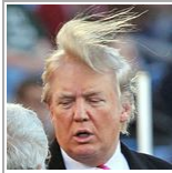
Trump's IQ Will Shock You