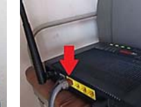
Breaking: Use This Trick Every Time You Connect To The Tech Advice