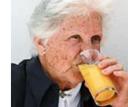
New Sleep Aid Takes CVS by Storm The Clever Owl