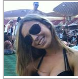
It Seems Like An Ordinary Photo But Take A Closer Look