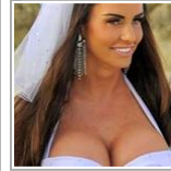
The Wedding Photographer Captured More Than Expected