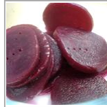
3 Foods Surgeons Are Now Calling "Death Foods"