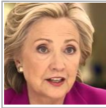
New Video Could Force Hillary To Give Up White House Dreams