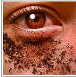
(1) Easy Method "Removes" Your Eyebags & Wrinkles In Minutes