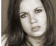
Enter Your Name, Wait 15 Seconds, The Results Are Instant Checkmate