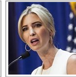
Can Ivanka Hide From The Rumors Any Longer?