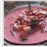
This Drink Recipe "Scrubs Away" Alzheimer's Disease