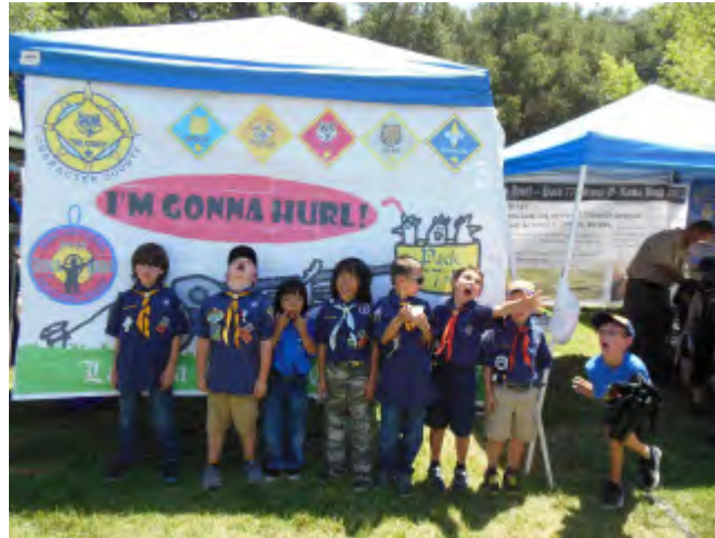
Pack 774, Laguna Niguel - Scout-O-Rama 2013