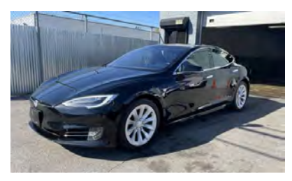
2017 Tesla Model S