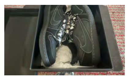
Phantom Black Travis Scott Air Jordan 1 low $500