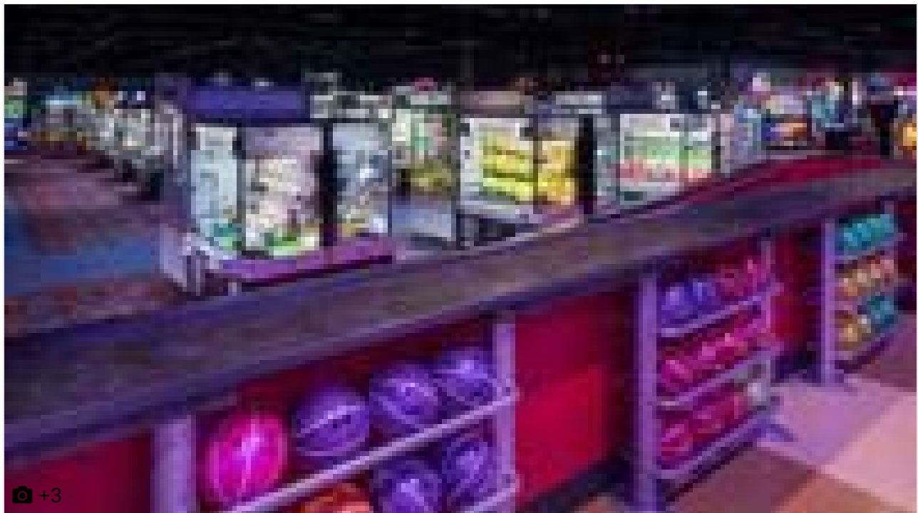
Japanese 'eatertainment' venue opening in Sears space at Tucson's Park Place