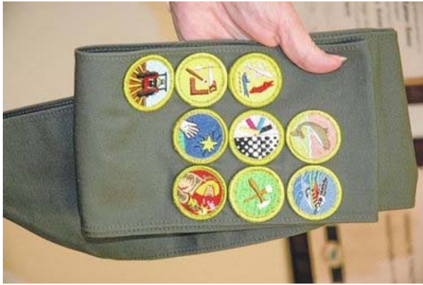
He earned so many badges, he had to start a second sash to hold them all.