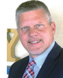
Julian Will Have a Bank Again: CVB Proves Itself with Personal Service