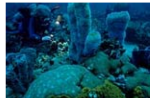
National Geographic Picture of the Day